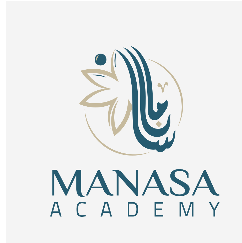
Don't Change the size relationship between the

We have identified a few ways the logo should NOT be used.