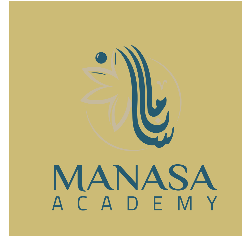
Don't place the logo on a background that does not provide sufficient contrast with all the logo's