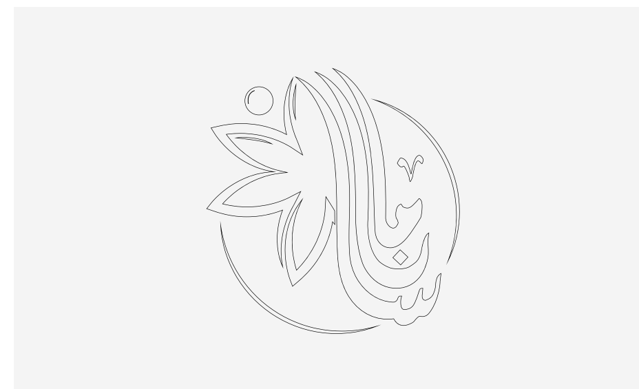
Don't outline the logo